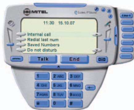
Mitel 5110 Softphone